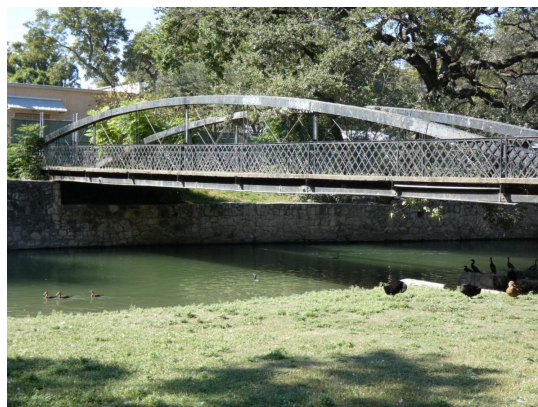
Bridge Co. of Cleveland, Ohio, in 1880.

A second truss bridge (above right, pictured today) was also damaged in the 1921 flood and relocated to the Park in 1925: